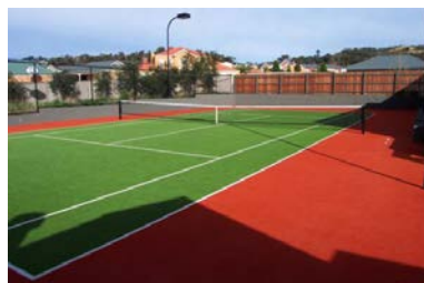
*Olive / Brick two tone court

A shorter pile (12mm) sand dressed surface, Commercial Grand Prix is designed for the club/shire that is looking for a dynamic and performance based tennis surface. Being made of S & Z twist yarn, the Commercial Grand Prix surface is very grippy underfoot and subsequently more responsive to slice and top-spin. It proves a heavier duty surface to meet the increased demand of club tennis. As with all Tiger Turf surfaces, Commercial Grand Prix is a full UV stabilised surface suited to the Australian climate.