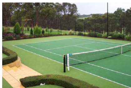
* Olive / Forest Green tennis court

With all surface options there are a number of different colours to choose from. These are available at no extra charge.