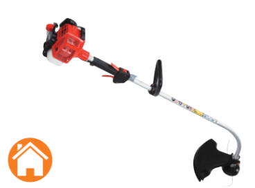
$259 INC GST ECHO GT22G LINE TRIMMER

21.2cc ECHO engine, 4.1kg dry weight, 146.5cm overall length, loop Handle