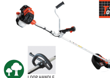
$739 INC GST

21.2cc ECHO engine, 4.1kg dry weight, 146.5cm overall length, Loop Handle