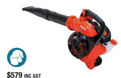
ECHO PB255ES POWER BLOWER

21.2cc ECHO engine, 4.1kg dry weight, 60m/sec air speed