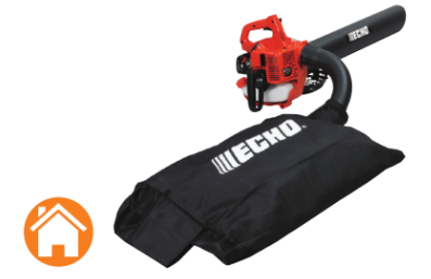
$399 INC GST

25.4cc ECHO engine, 4.8kg dry weight, 70.4m/sec air speed