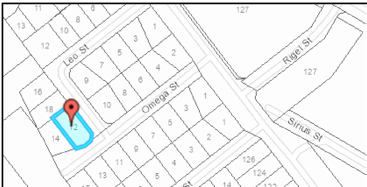
Above: Location Plan

A location plan is included below for convenience.