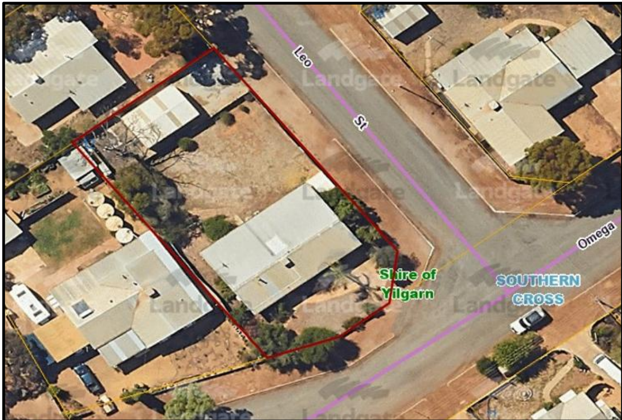
Above: Aerial Plan

There is an existing house and ancillary outbuildings on the property.