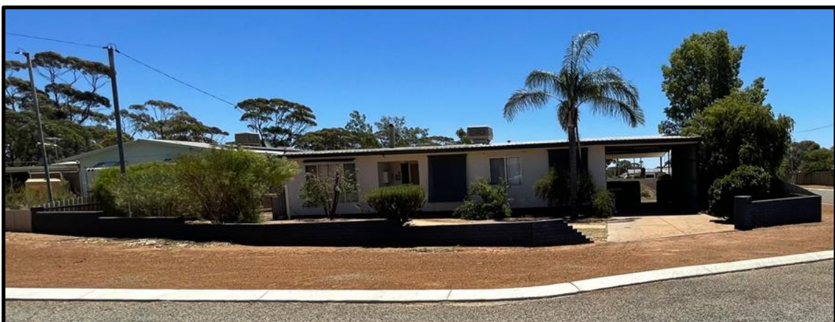
Above: Photograph showing existing driveway and carport accessed from Omega Street