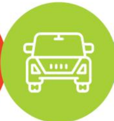
GOING FOR A DRIVE