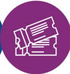
GOING TO AN EVENT TOGETHER