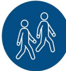
GOING FOR A WALK

Activities create conversation. Find an opportunity during everyday life activities to start the conversation and ask them how they are really feeling. Try doing activities together such as: