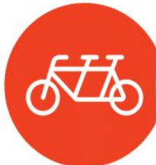
KICKING THE FOOTY, PLAYING A GAME, SURFING ETC