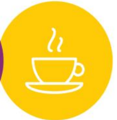
GOING FOR A COFFEE OR A MEAL