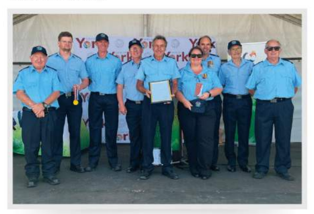
Photo: York Volunteer Fire and Emergency Services received the Active Citizenship Group / Event award for their continued efforts to keep the community safe.

It was a pleasure to join the community of York for their Australia Day and citizenship ceremony, celebrating the volunteers and community members who contribute to our towns and region. Congratulations to all that were recognised in their local awards!