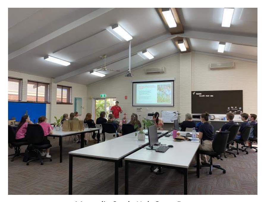
Merredin Study Hub Open Day

When: The Merredin Study Hub is usually open Monday – Thursday from 8.30am—5pm, Friday from 10am—5pm and Saturday from 10am—12pm.