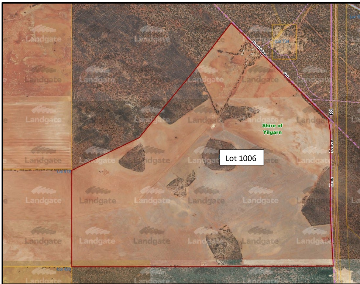
Above: Aerial Plan