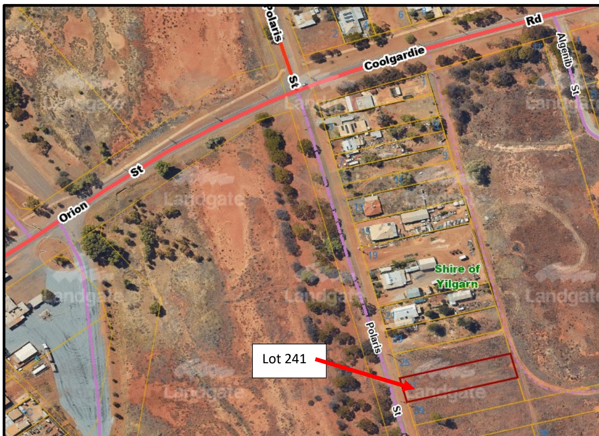
Above: Location Plan

The owner did not proceed with the development, and has lodged an application for a different transportable dwelling.