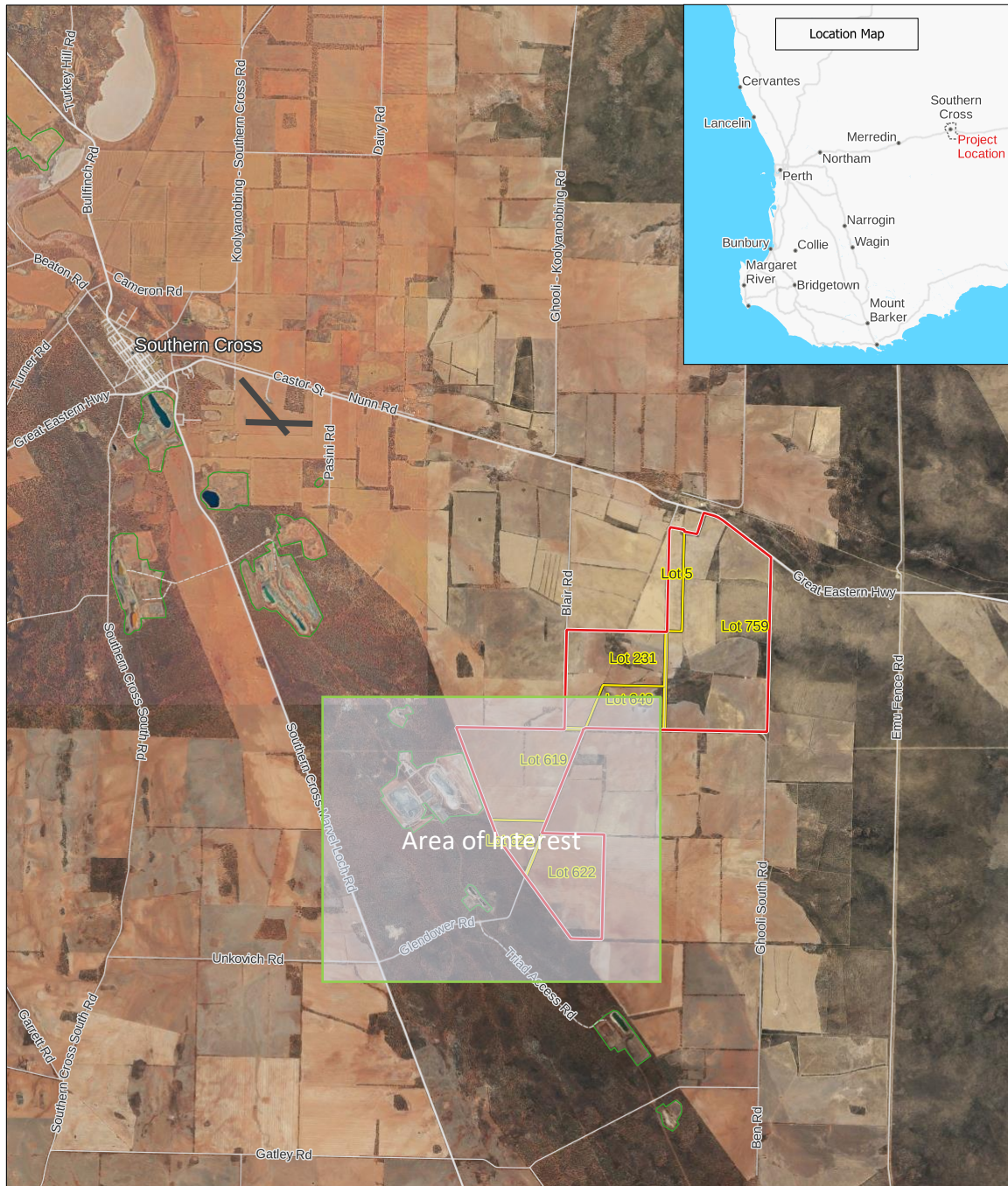
Figure 1: Southern Cross Wind Farm Location