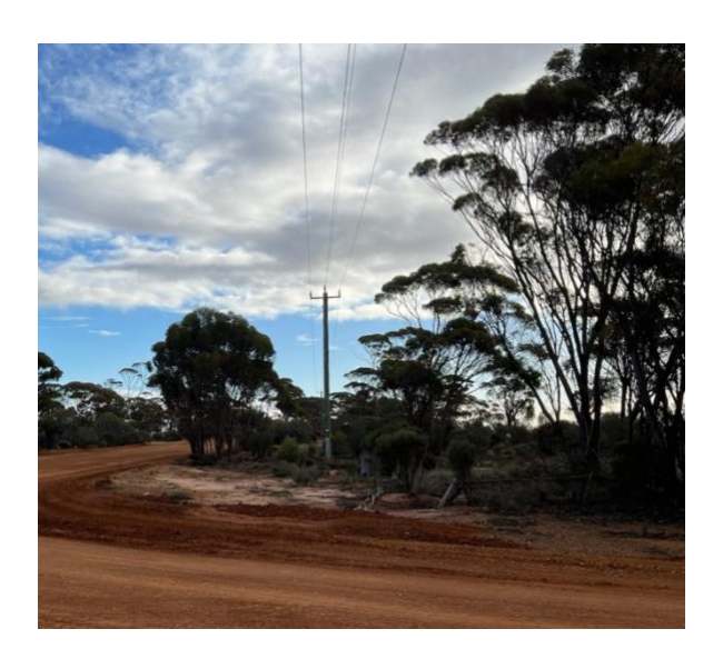
Attachment C. Typical overhead solution for 33 kV Power