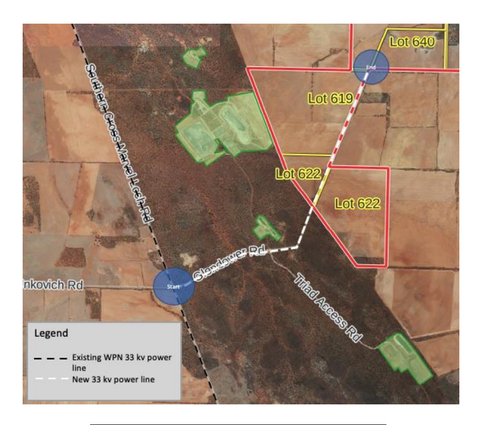
Attachment B. New 33kV Power Line Route