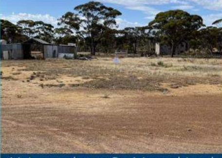
41 Lenneberg St, Marvel Loch