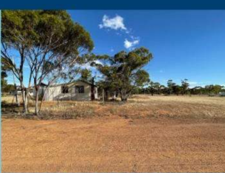
40 Griffiths St, Bodallin