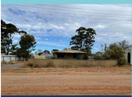
28 Horan St, Marvel Loch