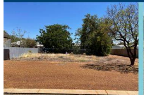
99 Canopus St, Southern Cross

Saturday, 17th September 2022 at 1pm Southern Cross Recreation Centre Lounge