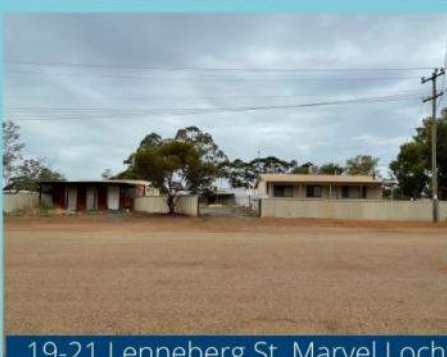
19-21 Lenneberg St, Marvel Loch