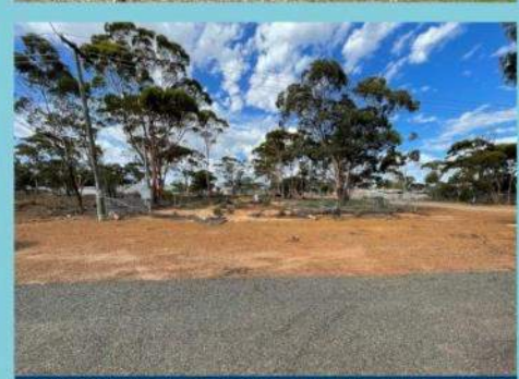
15 Williamson St, Marvel Loch 13 Overington St, Marvel Loch