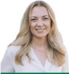
Hon Mia DAVIES MLA Leader of The Nationals WA Member for Central Wheatbelt