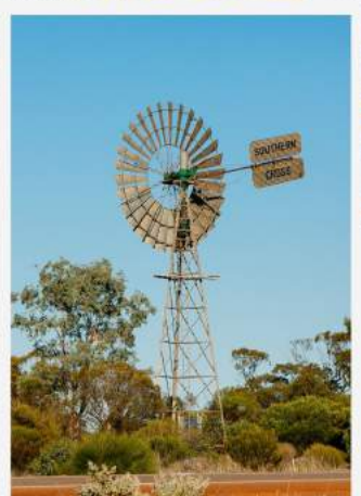
Tuesday 11th February 5pm - 7pm Southern Cross CRC