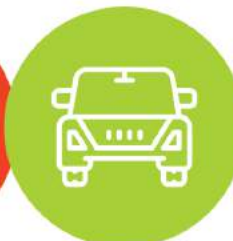
GOING FOR A DRIVE