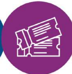
GOING TO AN EVENT TOGETHER