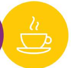
GOING FOR A COFFEE OR A MEAL